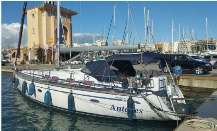
SY Antares in Torrevieja