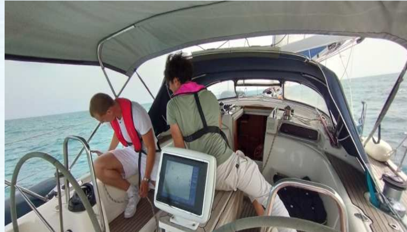
Manovertraining off the coast of Alicante