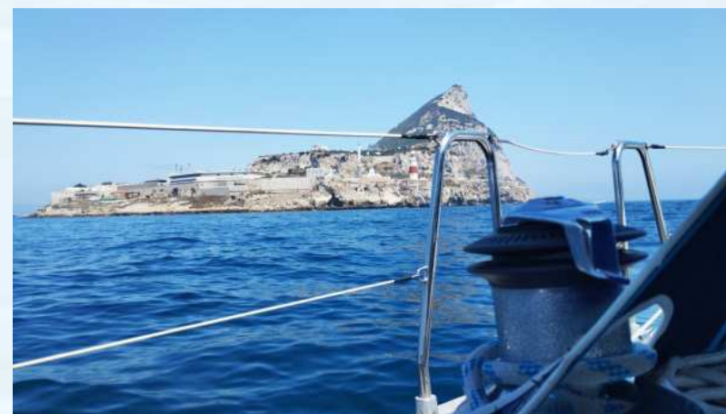
SY Antares off the coast of Gibraltar