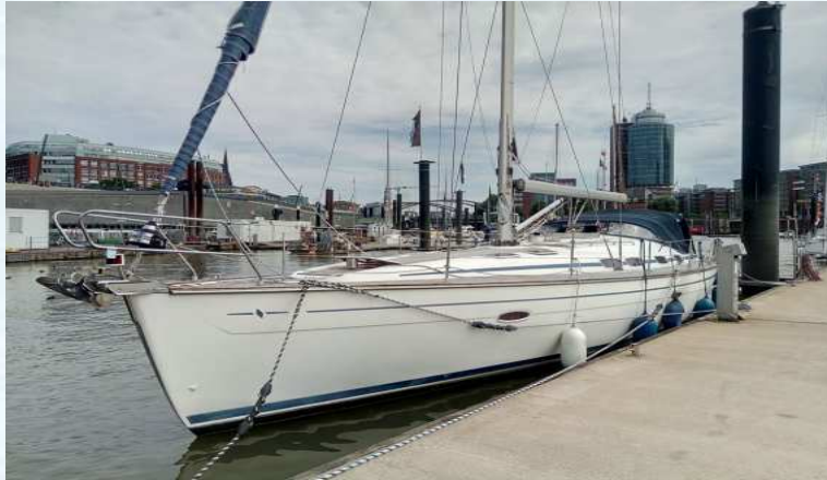
SY Antares in Hamburg Citysportboothafen