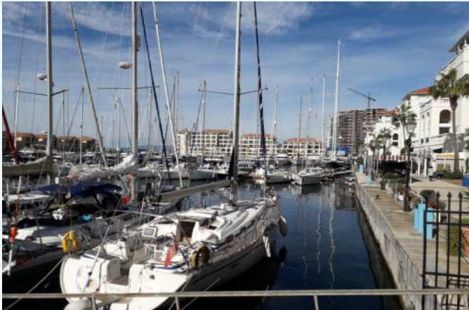
Bav. 46 in Gibraltar im Dezember: 19°C