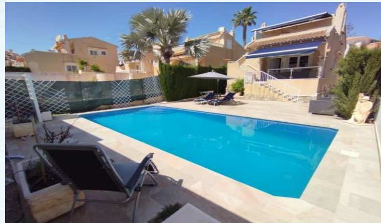
Unterkunft auch für Nicht-Segler