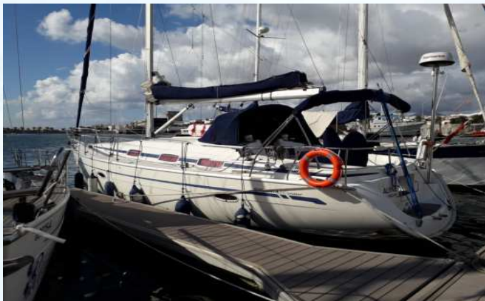
Bav. 39 in Arecife im Dezember: 23°C